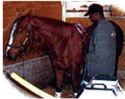
PAPIMI Used With Race Horses

Even though the initial capital outlay of the PAPIMI is relatively high at 44,000 EURO, the return is dramatically quick based upon my own clinical use – word soon gets around to other patients even without direct advertising and now it is being used pretty much to its full potential of 6-8 hours per day. See financial analysis HERE .